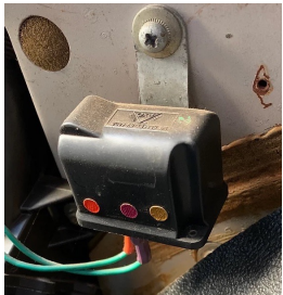
Door buzzer module under dash